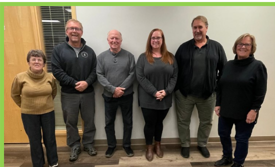
Rights Committee Members (L to R):

During this event, students and their families were able to hear presentations from Developmental Services Ontario/Housing Navigation - Passport Funding from EAFK and CICE program from Loyalist College.