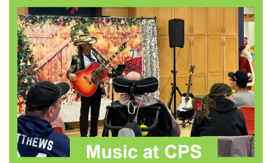
Music at CPS