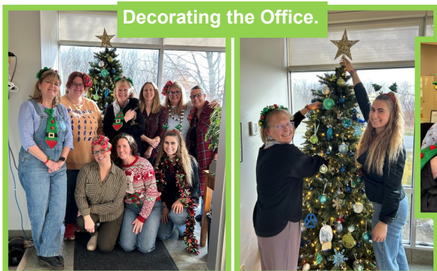
Decorating the Office.