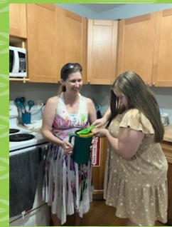
The Cooking Club in action.