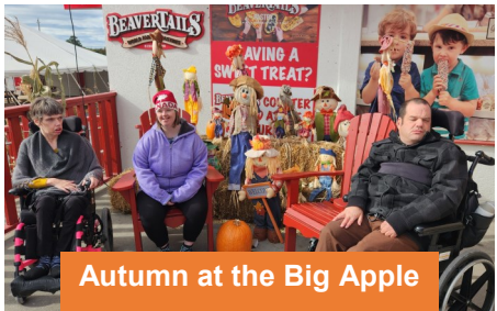
Autumn at the Big Apple