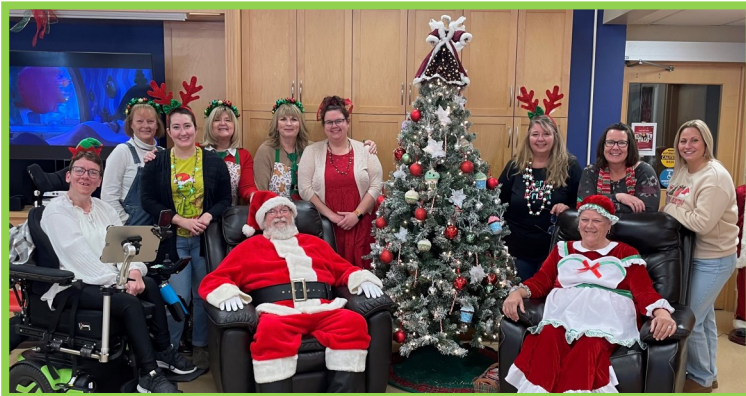
Holiday Party Committee

To the people who made the magic happen—thank you!