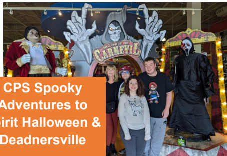
CPS Spooky Adventures to Spirit Halloween & Deadnersville